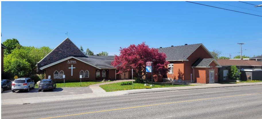
A photograph of St. Brice’s, taken this past Sunday. Please note the tree in full bloom, in the front yard.

The leadership at St. Brice’s continues to be committed to ensuring that we are good stewards of all that is entrusted to our care. Thanks be to God, who is the Beginning and the End of all things.