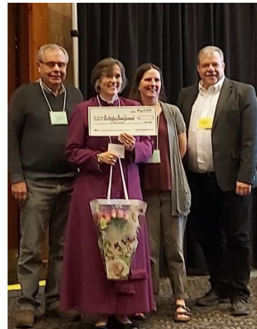
Figure 1 Archbishop Anne Germond at Synod, with the newly installed diocesan canons.

2. There is a long-term project to develop an Episcopal Fund , to fund the bishop's ministry. Once established, this will ensure a stable ministry in the future, and will lessen the allotment which parishes pay to the diocese.