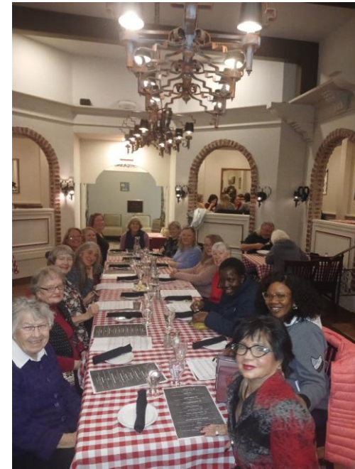
Figure 1 St. Brice's A.C.W. at their recent dinner to plan missions distributions

http://justus.anglican.org/resources/bcp/Nigeria_hc.htm